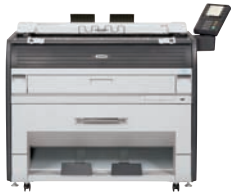
The KM-4800w Wide Format Multifunctional with standard network print, scan and copy 60.4"W x 29.4"D x 48.5"H