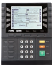
Large control panel features an easy to read display for copy and scan functions